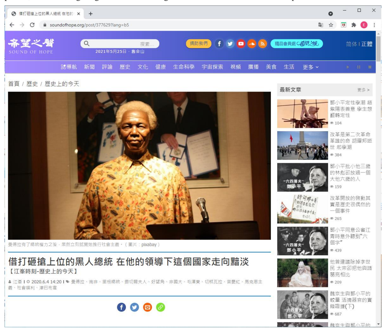
Figure 2. Online article denouncing former South African President Nelsen Mandela as a "Communist terrorist."

playing with fire and blaming the law-maker for "paying no attention to the incidents of beating, looting and destroying;" the author failed to mention excessive use of lethal forces by racist police, and blaming single mothers raising children without fathers for all problems.