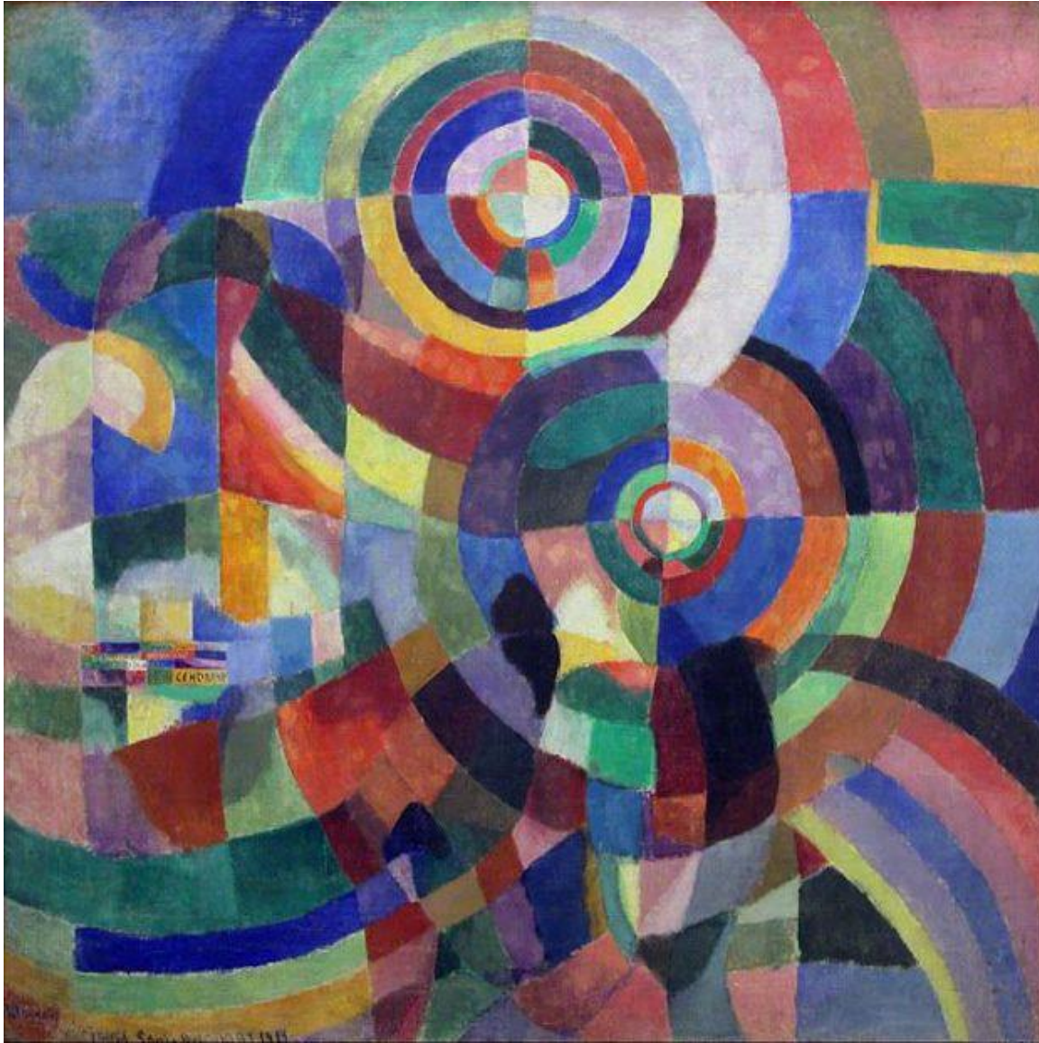
Figure 7. Sonia Delaunay's "Prismes électriques" (1914). Via Wikimedia Commons, https://www.curbed.com/2017/3/23/15025206/furniture-decor-art-design-mondrian-magritte . Images are too busy and color scheme chaotic.