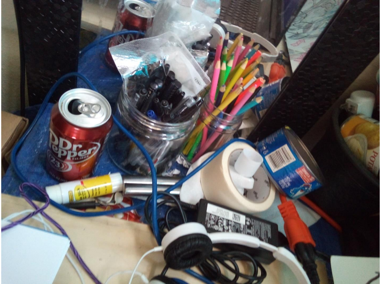
Figure 13. A corner of my table used during the Zoom meetings is chaotic and discording in colors too!

What I discovered in general about the danger of color discord are (1) the use of too many models of color harmony simultaneously, (2) no use of color harmony models, (3) the use of colors with similar values and intensities causing loss of focus. These are to be avoided in my future artistic creation. Certain colors like blue, red, violet and cool grays seem to have greater danger of being elements of discord, as shown in the mural images.