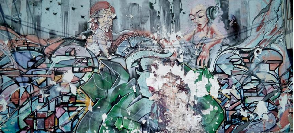
Figure 4. Part of a series of murals in the neighborhood by the Atlantic Station of the Metro Gold Line in East Los Angeles. Colors and shapes look chaotic and irritating, although color schemes seem to be one set of analogous (blue and green), and one set of complementary (red and green), plus another set of analogous (red and brown or dark red)..