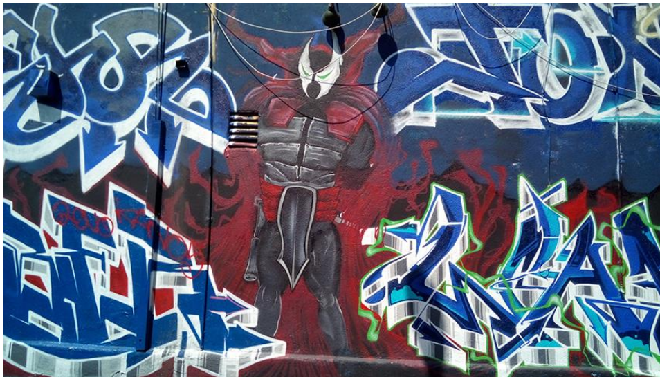
Figure 3. Same as in Figure 2.