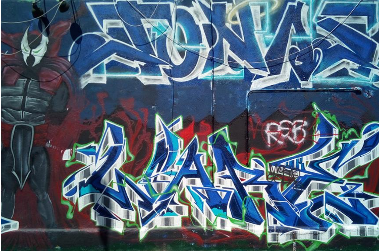
Figure 2. Part of a series of murals in the neighborhood by the Atlantic Station of the Metro Gold Line in East Los Angeles. Colors and shapes look chaotic and irritating, although color schemes seem to be one set of analogous (blue and green), and one set of complementary (red and green).