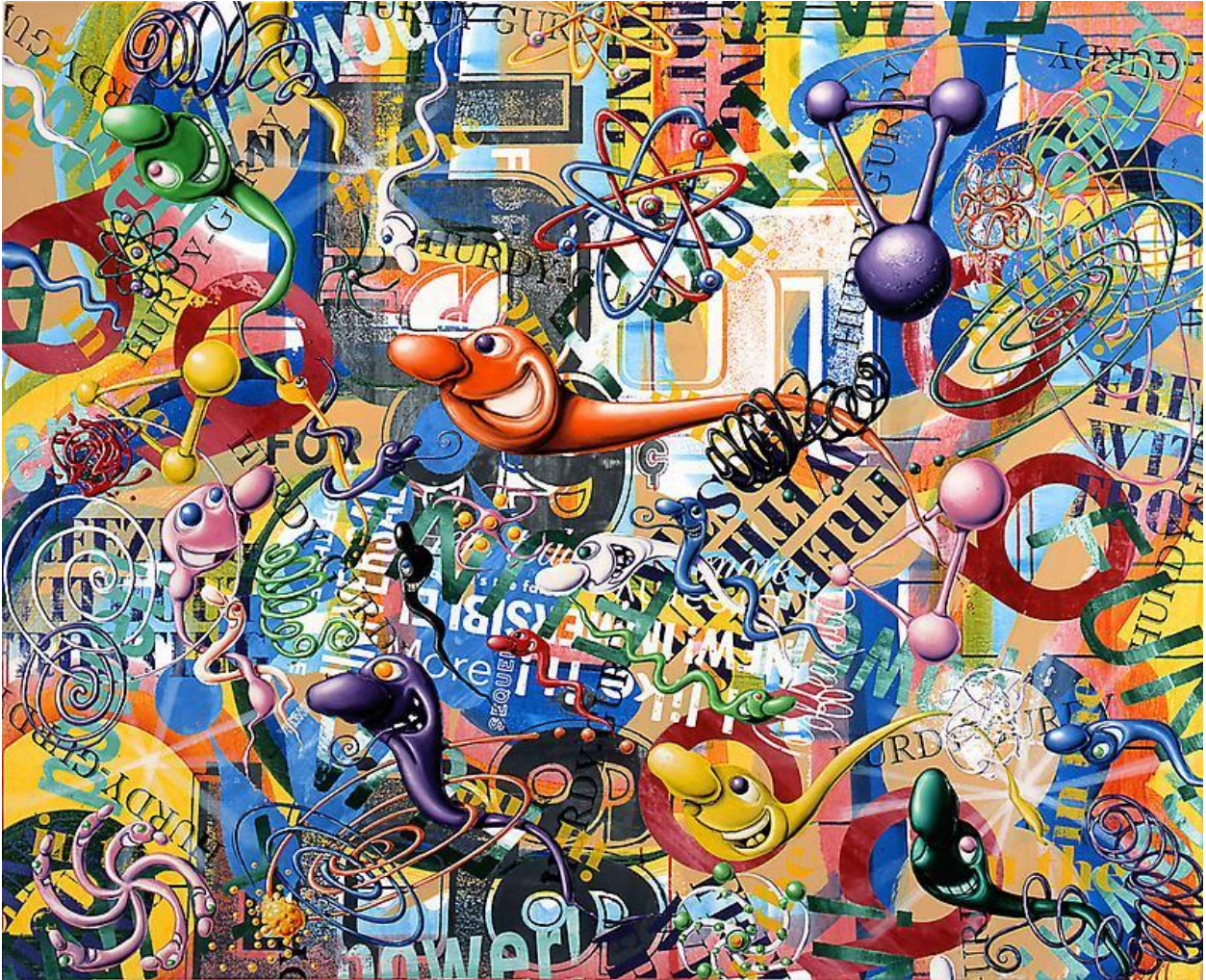
Figure 11. Kenny Scharf, Escape into Life , https://www.escapeintolife.com/artist-watch/kenny-scharf/ . Images are too busy and color scheme confusing. The colors are all of the same intensity, causing them to compete and produce tension to my eyes.