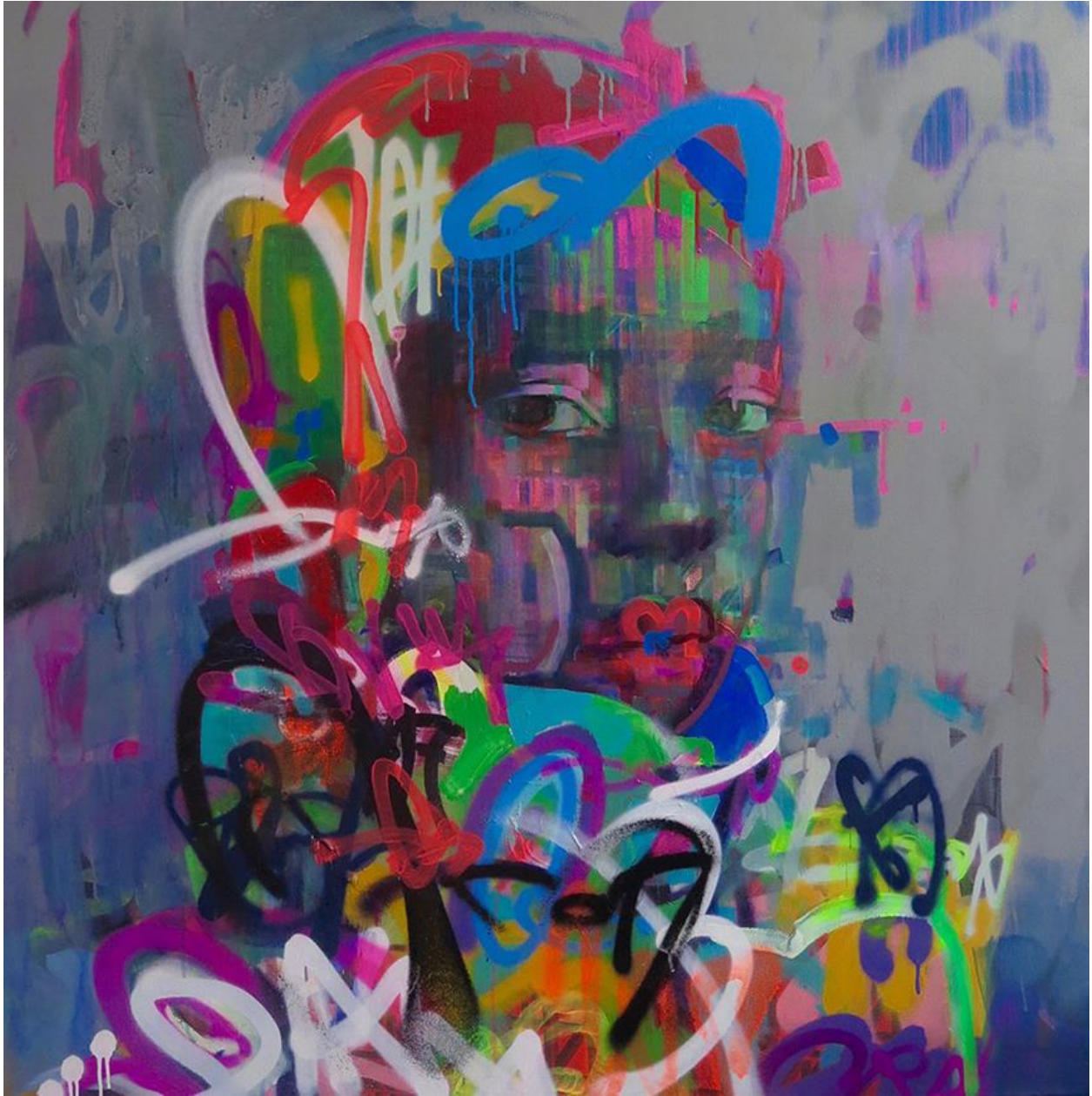
Figure 8. Kilmany-Jo Liversage, Southern Vines, https://www.southernvines.co.za/2018/03/16/art-scene-kilmany-jo-liversage/ . Images are too busy and color scheme chaotic.