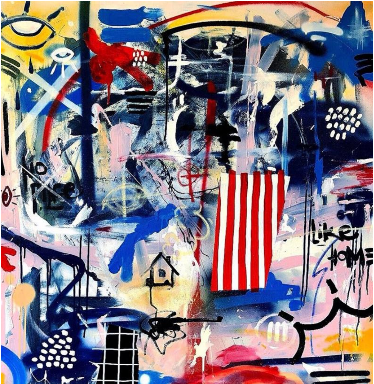
Figure 9. Dean Sunderland, No place like home , Mixed Media, Ready to hang, 91cm (W) x 91cm (H) x 5cm (D). Images are too busy and color scheme chaotic. The colors and shapes all clashes to the eye sight.