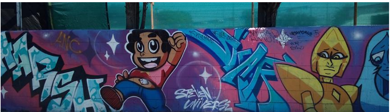
Figure 6. Part of a series of murals in the neighborhood by the Atlantic Station of the Metro Gold Line in East Los Angeles.