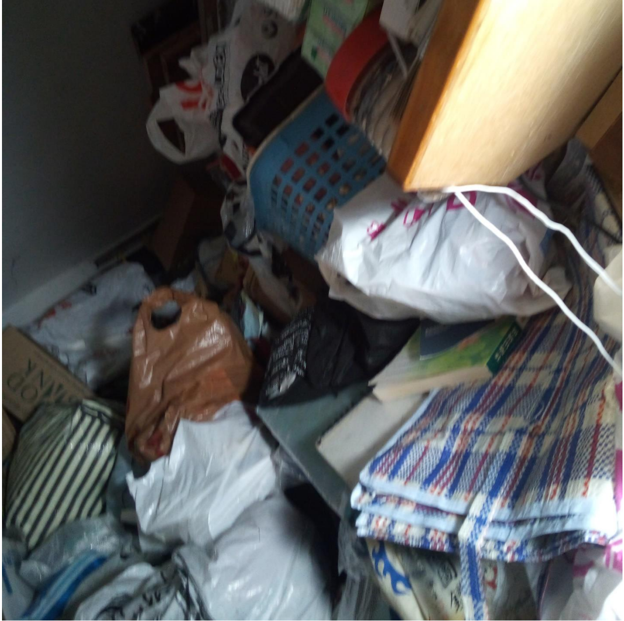
Figure 12. A corner of my art supply storage is chaotic and discordant in colors too!