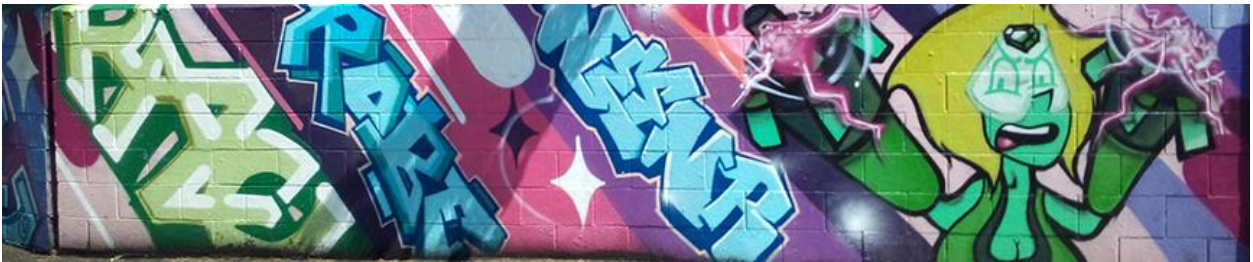
Figure 5. Same as in Figure 2, but graphical elements are shaped more nicely.