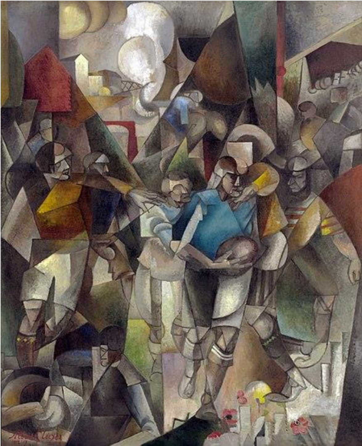
Figure 10. Albert Gleizes, 1912-13, Les Joueurs de football (Football Players), oil on canvas, 225.4 x 183 cm, National Gallery of Art, Washington D.C. Galeries Dalmau, 1916, https://www.wikiwand.com/en/Galeries_Dalmau . Images are too busy and color scheme chaotic. The colors are all of the same intensity, causing them to compete and produce tension to my eyes.