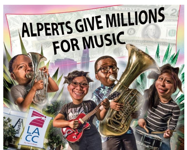
Alperts Give Millions for Music, a photo-illustration created for a front page news story (Collegian Newspaper of Los Angeles City College), in celebration of a large donation by the Alperts Foundation to the Music Department (Society of Professional Journalists National Winner of Mark of Excellence Award for Photo Illustration, July, 2017).