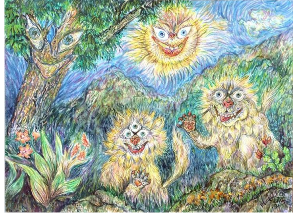
A dream world nightly scene with happy animals, smiling tree and light source (Pasadena City College Juried Student Arts Exhibition, November 22, 2016 to January 12, 2017, Boone Family Gallery, Center for the Arts).