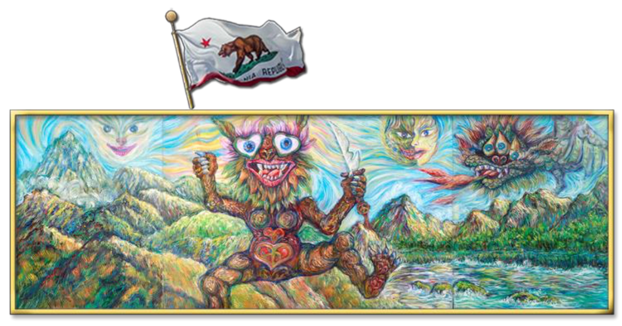
A dream world scenery combining California landscape with dream world features of smiling sun and moon as well as fantasy animals.