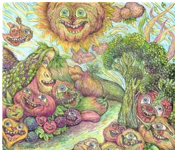
A Giuseppe Arcimboldo style scenery from California (selected as a Featured Artist piece and exhibited at Guisados Restaurant, November 2017 to January 2018, 541 South Spring Street, Los Angeles, CA 90013, http://www.guisados.co/dtla-multi-artist ).