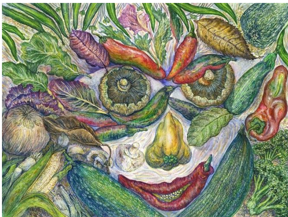
A Giuseppe Arcimboldo style smiling face to celebrate vegetarianism (Pasadena City College 65th Annual Scholarship & Awards Exhibition, June 1 to July 14, 2017, Boone Family Gallery, Center for the Arts).