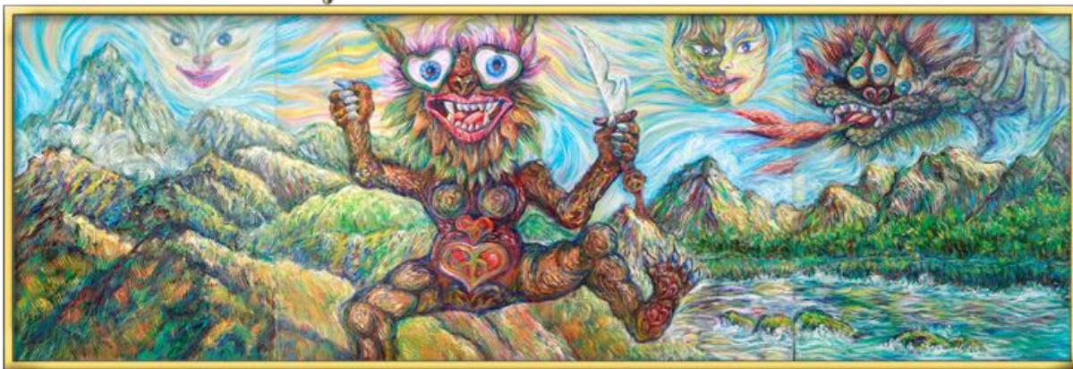
A dream world scenery combining California landscape with dream world features of smiling sun and moon as well as fantasy animals.