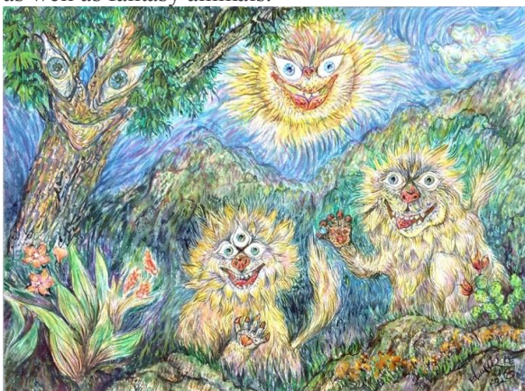
A dream world night scene with happy animals, smiling tree and light source (Pasadena City College Juried Student Arts Exhibition, November 22, 2016 to January 12, 2017, Boone Family Gallery, Center for the Arts).